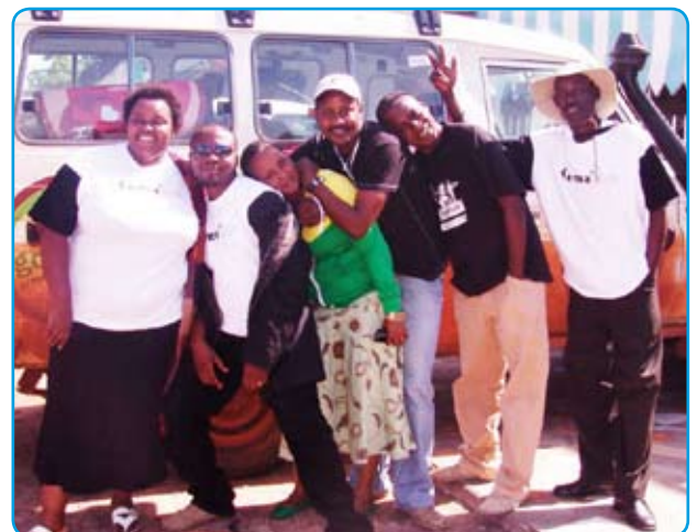
The Femina HIP team poses in Tabora town.

A bizarre thing happened in Tabora region when the Community Mobilisation team was on the road about 200 kilometres from Tabora town. They were on their way to Usinge in Urambo district when they came across two women (each with a baby on her back) and asked them for directions. The women showed them the way and then asked where the team was from. Upon hearing that they had travelled from Dar es Salaam, the women took off running without hesitation and without explanation. Needless to say, the team was left baffled!