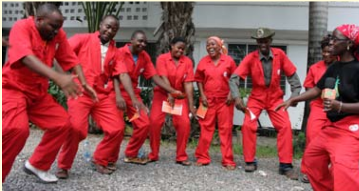
Contestants and presenters share a moment of fun at boot camp

A s of this March, Fema TV Talk Show is back on air with a special season called Ruka Juu na Fema TV Talk Show. Focusing on entrepreneurship and self-empowerment, this exciting season follows six young micro-entrepreneurs from different regions of Tanzania, as they compete in several challenges for a cash prize. Promotion for the show was launched at Femina HIP's annual Youth Conference in January, where 110 students and teachers from all over Tanzania gathered to discuss the theme "Ruka Juu! Jenga Maisha Yako." ("Jump Up! Build Your Life.")