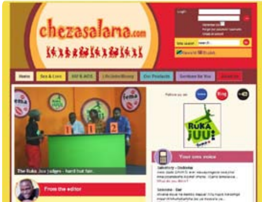
The chezasalama.com home page

The year 2011 came with some exciting changes and improvements to our New and Social Media agenda. We restructured our interactive website chezasalama.com and gave it a new look. We are also enhancing the site through social media. Now that Femina HIP is on Facebook and YouTube and maintaining a blog, we are experimenting with ways to interact with young people in their territory, as well as reach out to them with information.